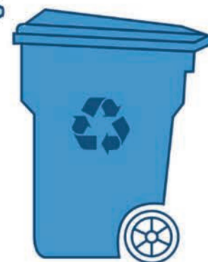
27.5"D x 24.5"W