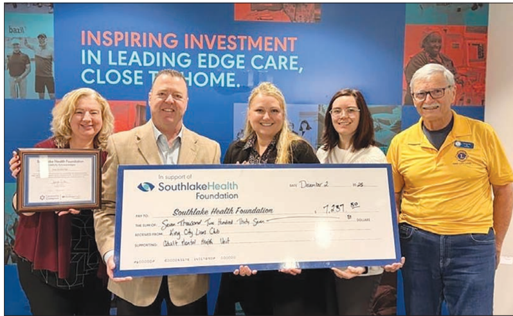
Lions boost Southlake

For more, visit https://theobiproject.com/ or email info@theobiproject.com