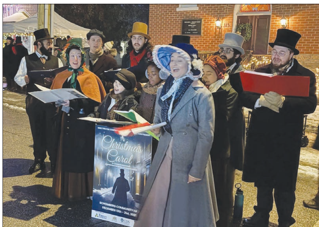
A Christmas Carol runs through Dec. 21

Please see our website, allsaintsking-city.ca , for information about our services and other upcoming events.