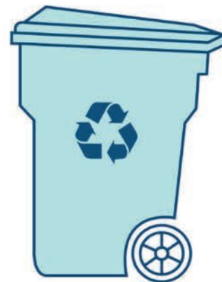
32.5"D x 29.5"W