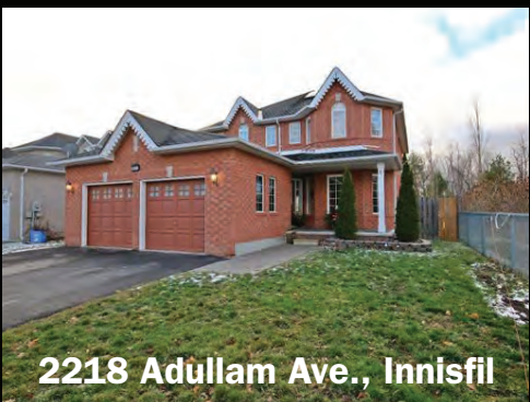
2218 Adullam Ave., Innisfil