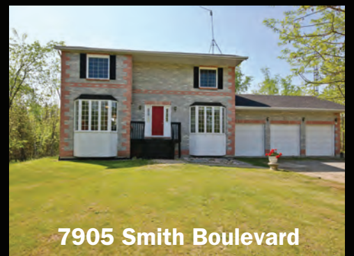
7905 Smith Boulevard