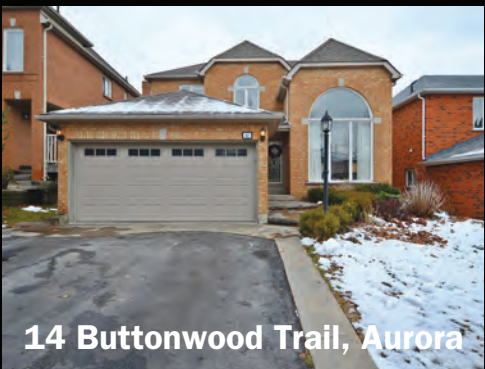
14 Buttonwood Trail, Aurora