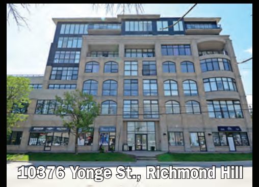
10376 Yonge St., Richmond Hill

"As I reflect on the past year, I am so thankful for the wonderful people who have made this year so special. I am very fortunate to have a loyal family of clients who not only trust me with their real estate needs, but refer me to their family and friends.