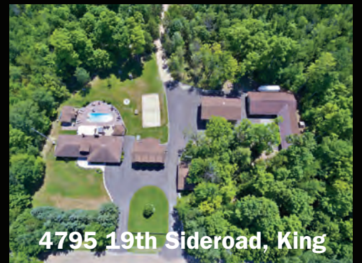
4795 19th Sideroad, King