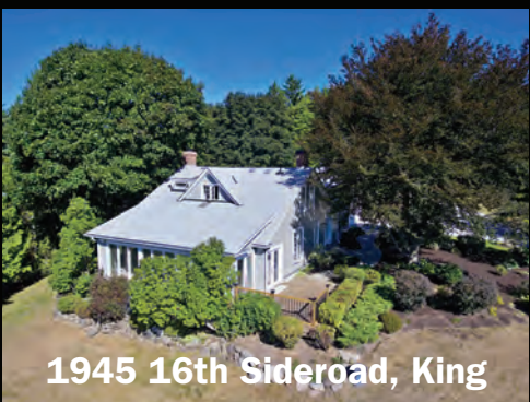
1945 16th Sideroad, King